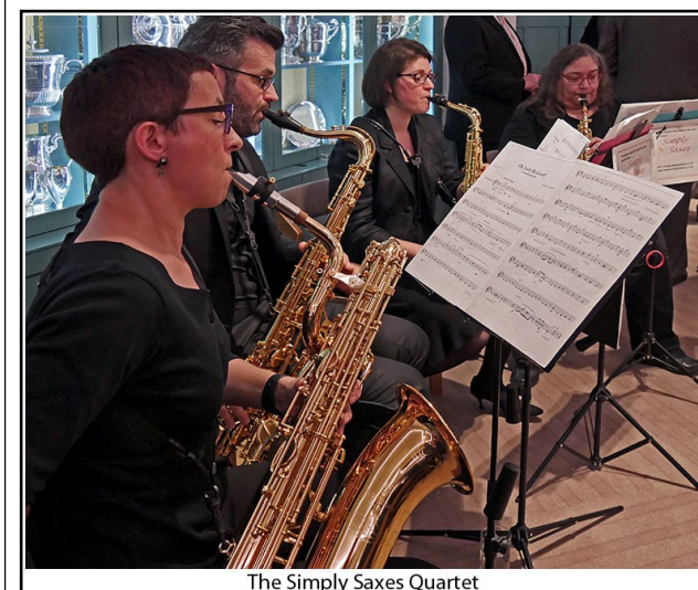
The Simply Saxes Quartet

The Master invited all Liverymen, their escorts and guests to join her for a Jazz Evening following a meeting of the Court, at our Hall on Tuesday 16 th January. The evening started with a champagne reception at 6:45pm. The event was informal so there was no need to dress up. There was no table plan and people sat where they wished. The jazz music started at 7pm.