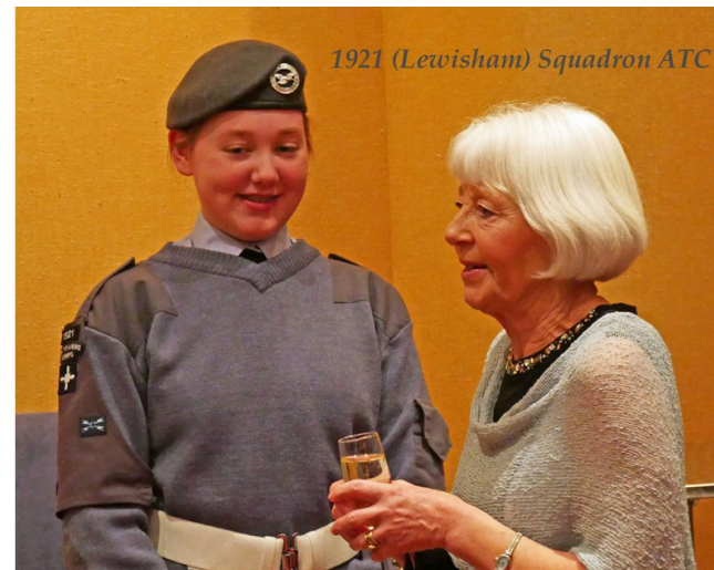
1921 (Lewisham) Squadron ATC