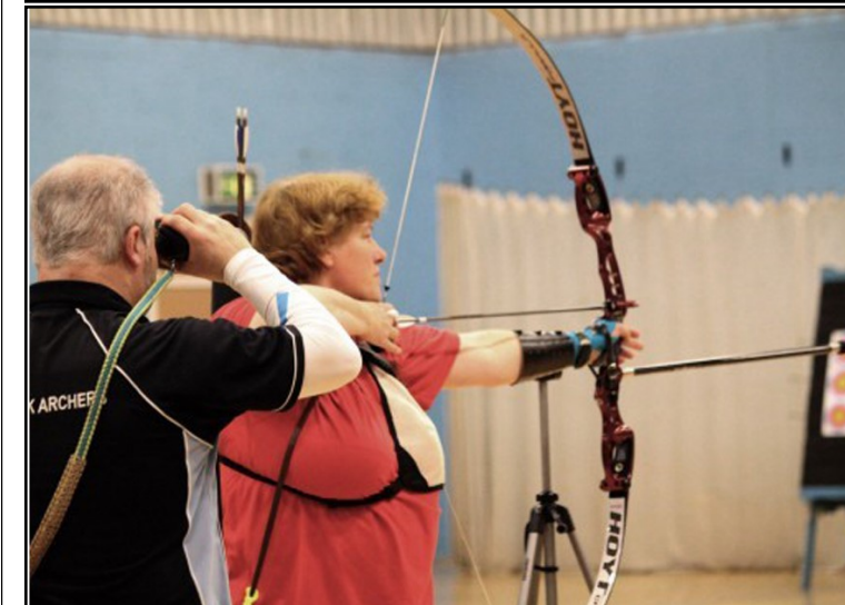
A VISUALLY IMPAIRED ARCHER